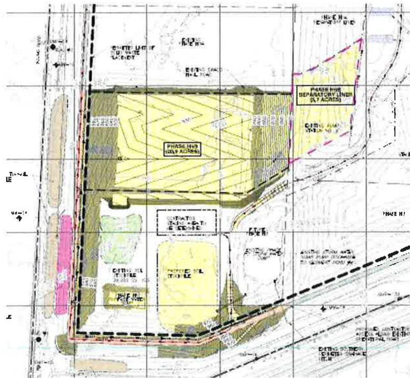
H5B Cell Construction