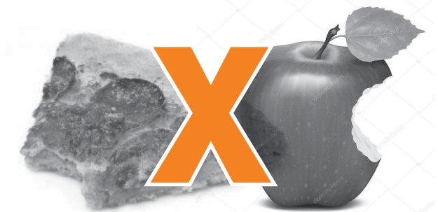
PARTIALLY EATEN FOODS