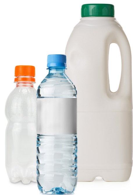
PLASTIC BOTTLES & JUGS Please empty, leave caps on