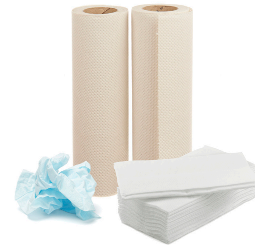
NAPKINS / TISSUES / PAPER TOWELS