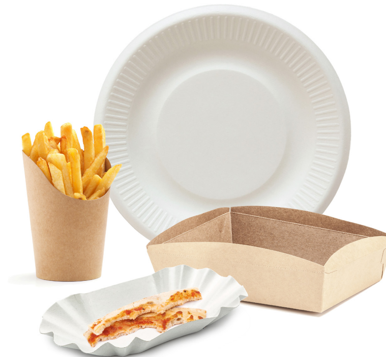
PAPER CUPS & PLATES