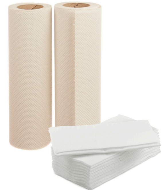
NAPKINS & PAPER TOWELS