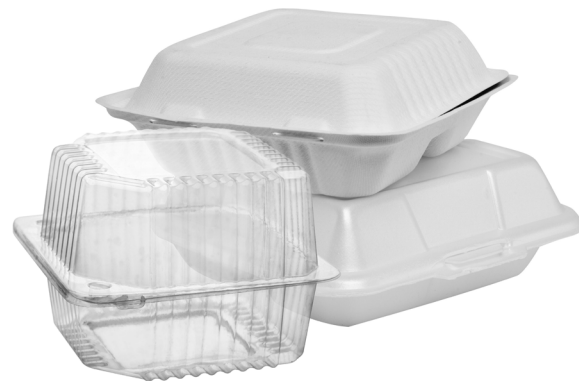
PLASTIC & FOAM CONTAINERS