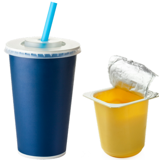
PLASTIC & FOAM CUPS