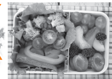
ITEMS FROM HOME