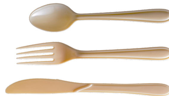
UTENSILS / STRAWS