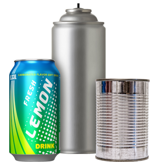
METAL CANS Remove aerosol tips