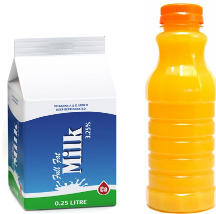
UNOPENED MILK & BEVERAGES