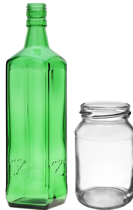
GLASS BOTTLES & JARS Remove lids