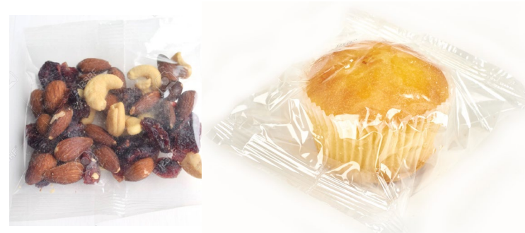
UNOPENED SNACK ITEMS FROM SCHOOL (NUTS, CHIPS, BREADS, ETC.)