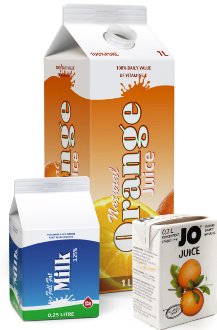
CARTONS Remove lids