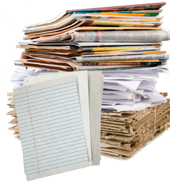
PAPER & CARDBOARD Please flatten