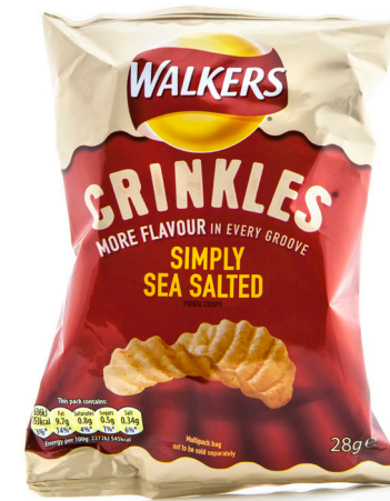
CHIP BAGS / WRAPPERS