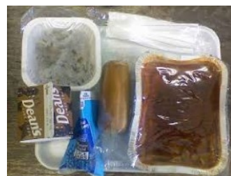
UNOPENED PACKAGED HOT & COLD FOOD