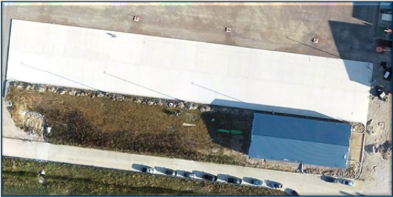
A closer aerial view of the CNG Station site location.