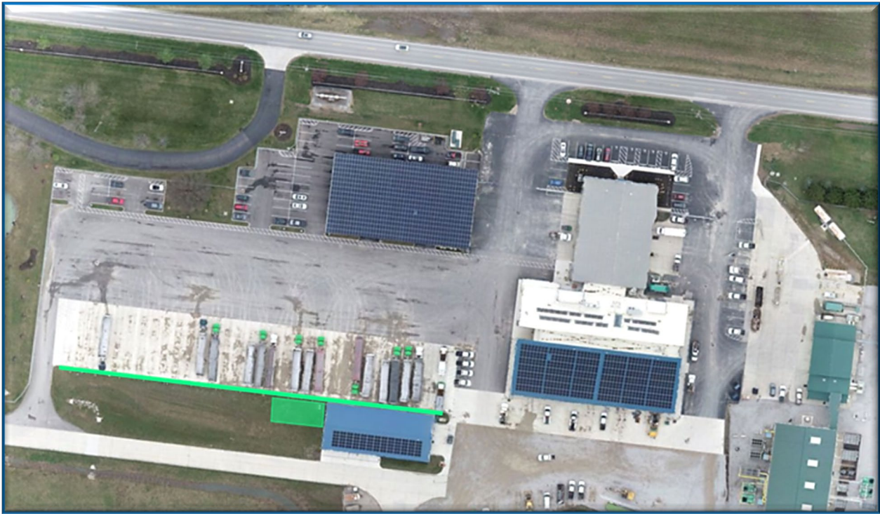
Aerial view of the Fleet/Operations Building. CNG Station site location is below the green line.